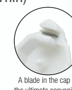
A blade in the cap for the ultimate convenience

Note: All Z-Twist cords are currently under promotion. Please visit www.gingi-pak.com for a complete list of items.